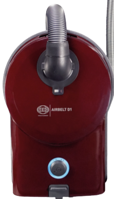
AIRBELT D1 Turbo Black Cherry #90604AM