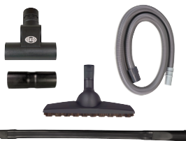
AIRBELT D4 Premium Black #90940AM

Flat-to-the-floor, 3.5-inch Profile – A low, cleaning-head profile makes reaching under furniture and beds easy!