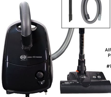
AIRBELT E3 Premium Black #91650AM