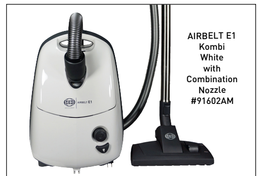
AIRBELT E1 Kombi White with Combination Nozzle #91602AM

Push-button Cord Rewinder – The power cord rewinds by simply pressing a button.