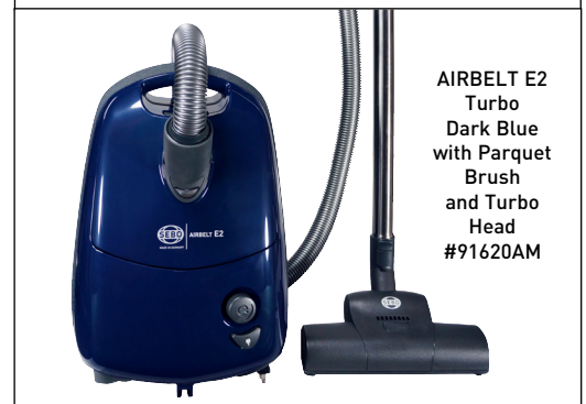
AIRBELT E2 Turbo Dark Blue with Parquet Brush and Turbo Head #91620AM