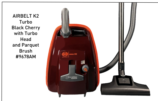
AIRBELT K2 Turbo Black Cherry with Turbo Head and Parquet Brush #9678AM