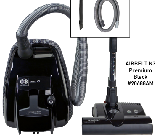
AIRBELT K3 Premium Black #90688AM

Three-step Filtration – They feature an S-class pre-motor microfilter, a three-layer AeraPure™ bag, an exhaust filter, and a tightly sealed casing, which prevents dirty air from escaping through its seams. An optional HEPA pre-motor microfilter is also available.