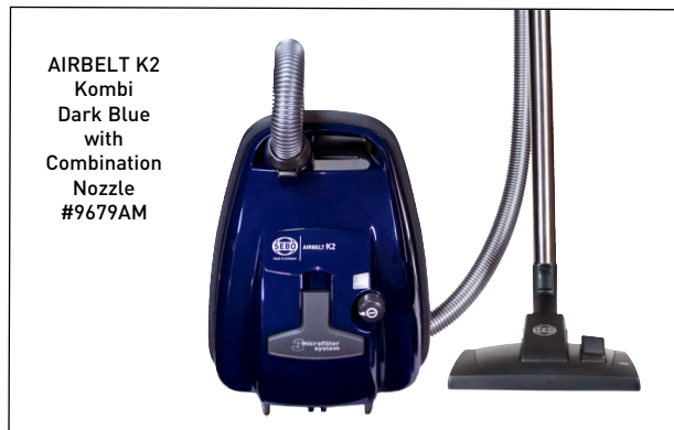
AIRBELT K2 Kombi Dark Blue with Combination Nozzle #9679AM