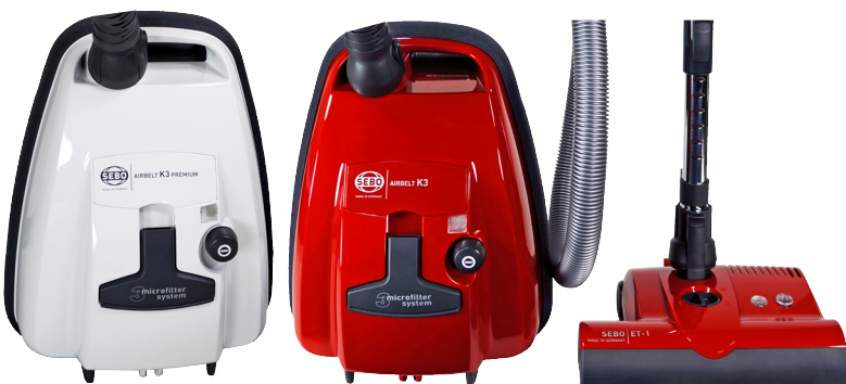
AIRBELT K3 Premium Red with ET-1 and Parquet Brush #90687AM