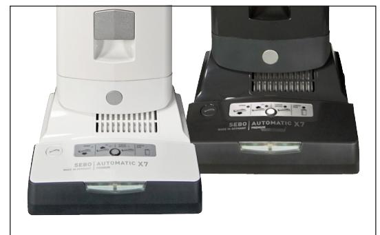
AUTOMATIC X7 Premium Graphite #91543AM