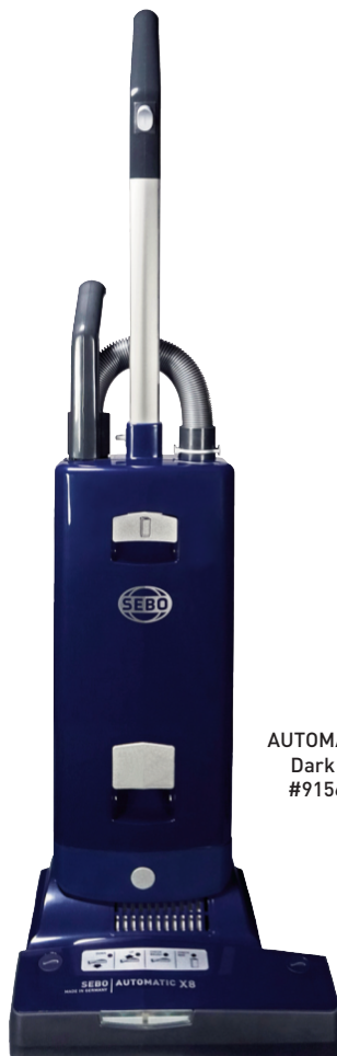
AUTOMATIC X8 Dark Blue #91566AM